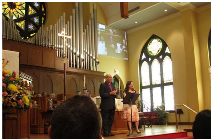
Bishop preaching Sunday morning at Hyde Park