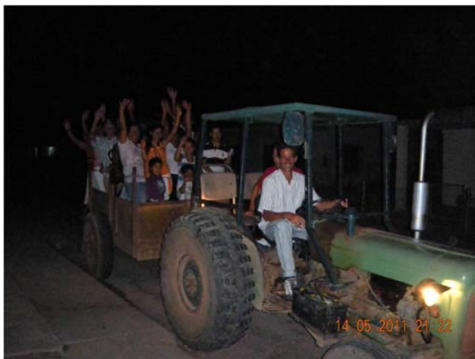
La Sierra's new tractor, a gift from their sister church